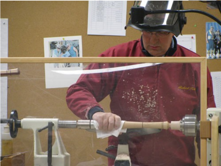
The finished product, which was raffled off to a lucky winner !