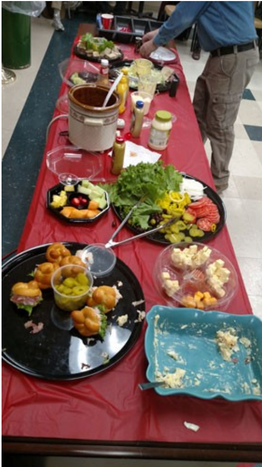
The buffet table

The club's December meeting was replaced with a holiday party featuring great food and fun conversations. There was a gift exchange and a People's Choice contest. Pictures are below.