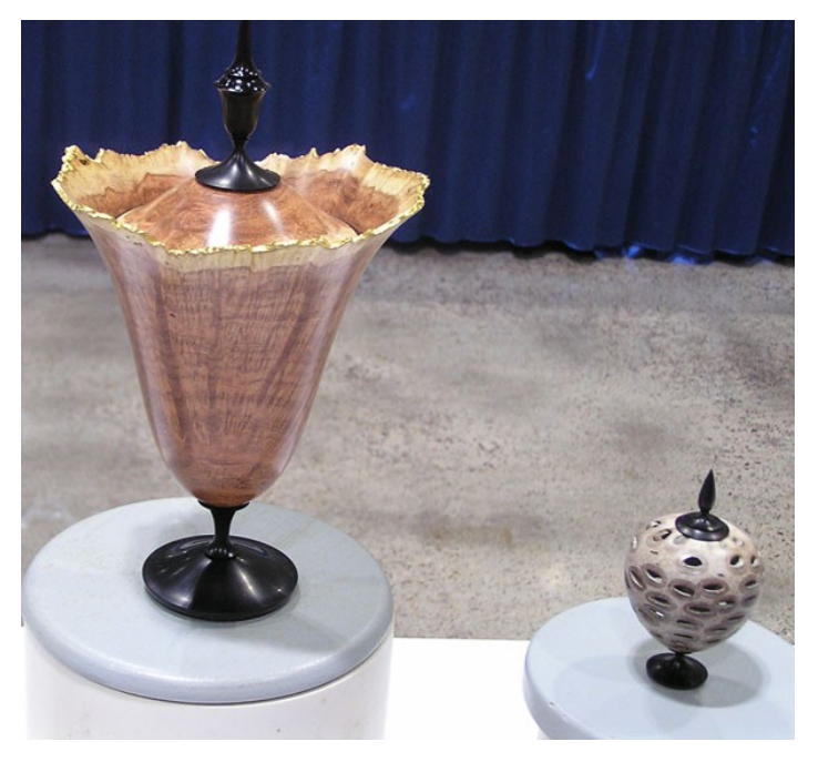
Some of the fabulous items on display in the Instant Gallery.