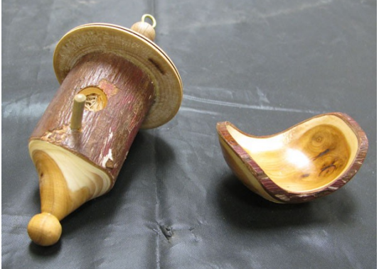
A bird house and miniature natural edge bowl by Dave Maidt.