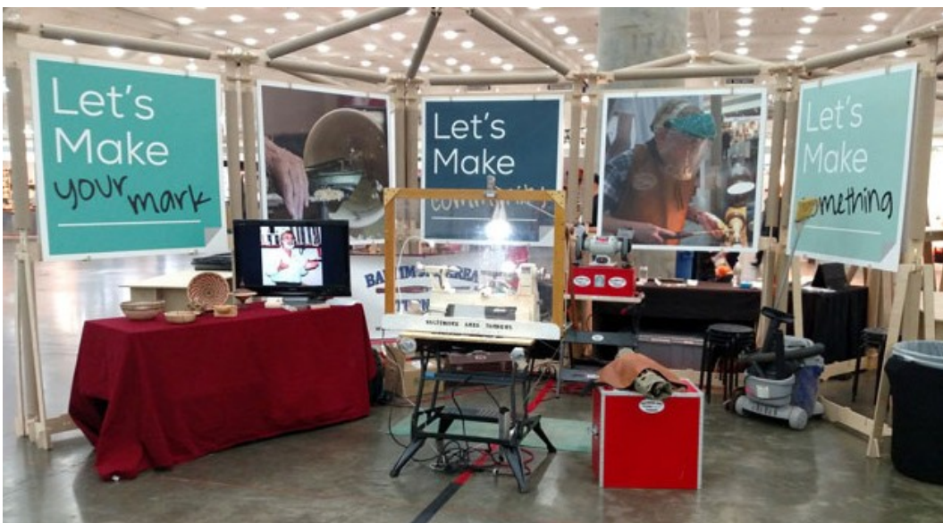
The BAT booth at the ACC Show at the Baltimore Convention Center.

For the sixth year in a row, the Baltimore Area Turners were invited to demonstrate the process of woodturning at the American Craft Council show at the Baltimore Convention Center. The ACC show is a premier art and craft show held every year in multiple cities across the nation. The show is an enormous display of works of top-drawer artists in textiles, glass, jewelry, wood art, furniture, textiles and more.