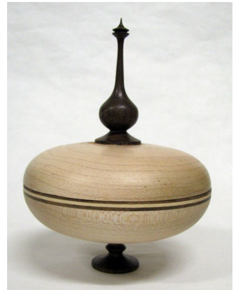
Presidential Challenges - 2017