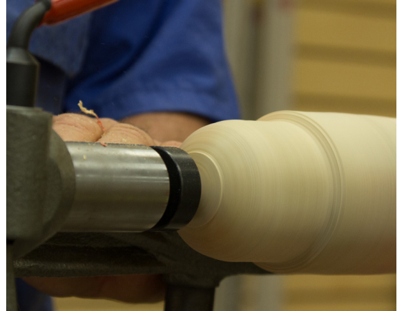
Turning the globe exterior.