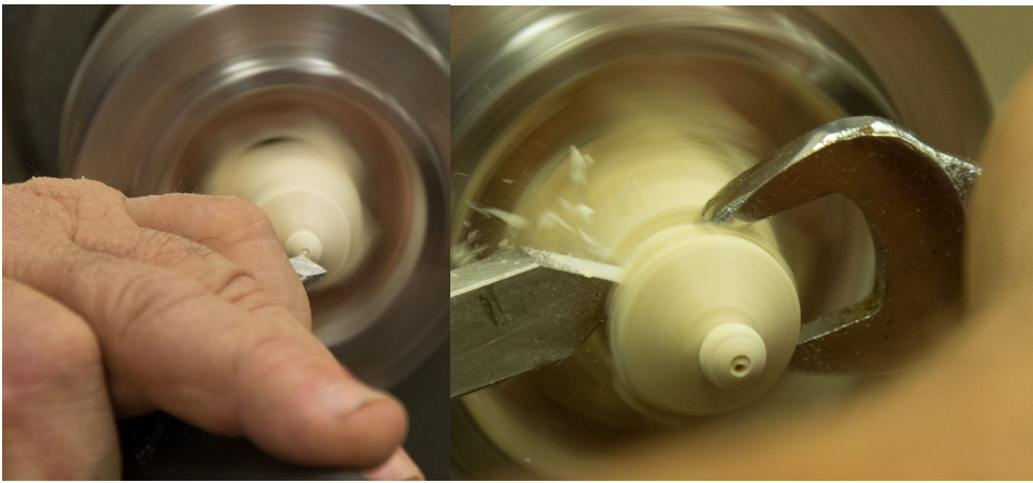
Using skew to make pilot hole.