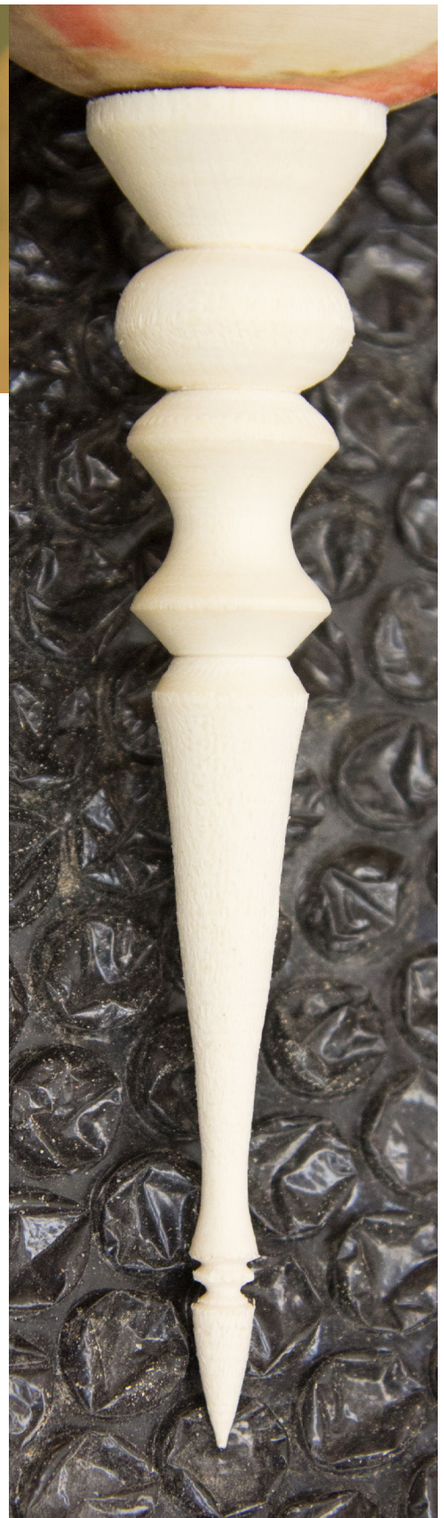
The completed finial.