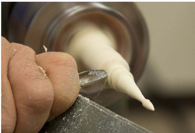
Turning the finial profile.