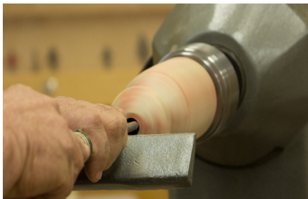
(Clockwise from lower right) Boring out the center; the straight and hooked Hunter tools; hollowing in progress.