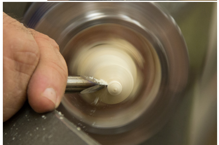
Turning the cap with a point tool.