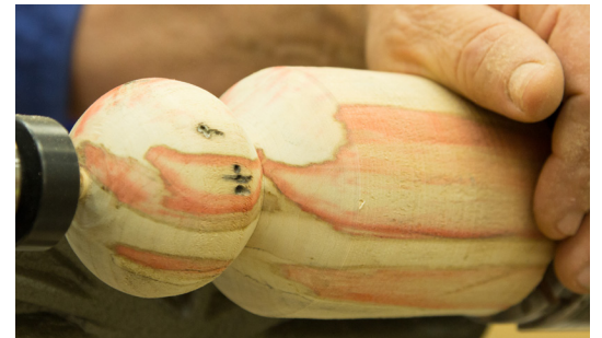
The final shape - ready to hollow.